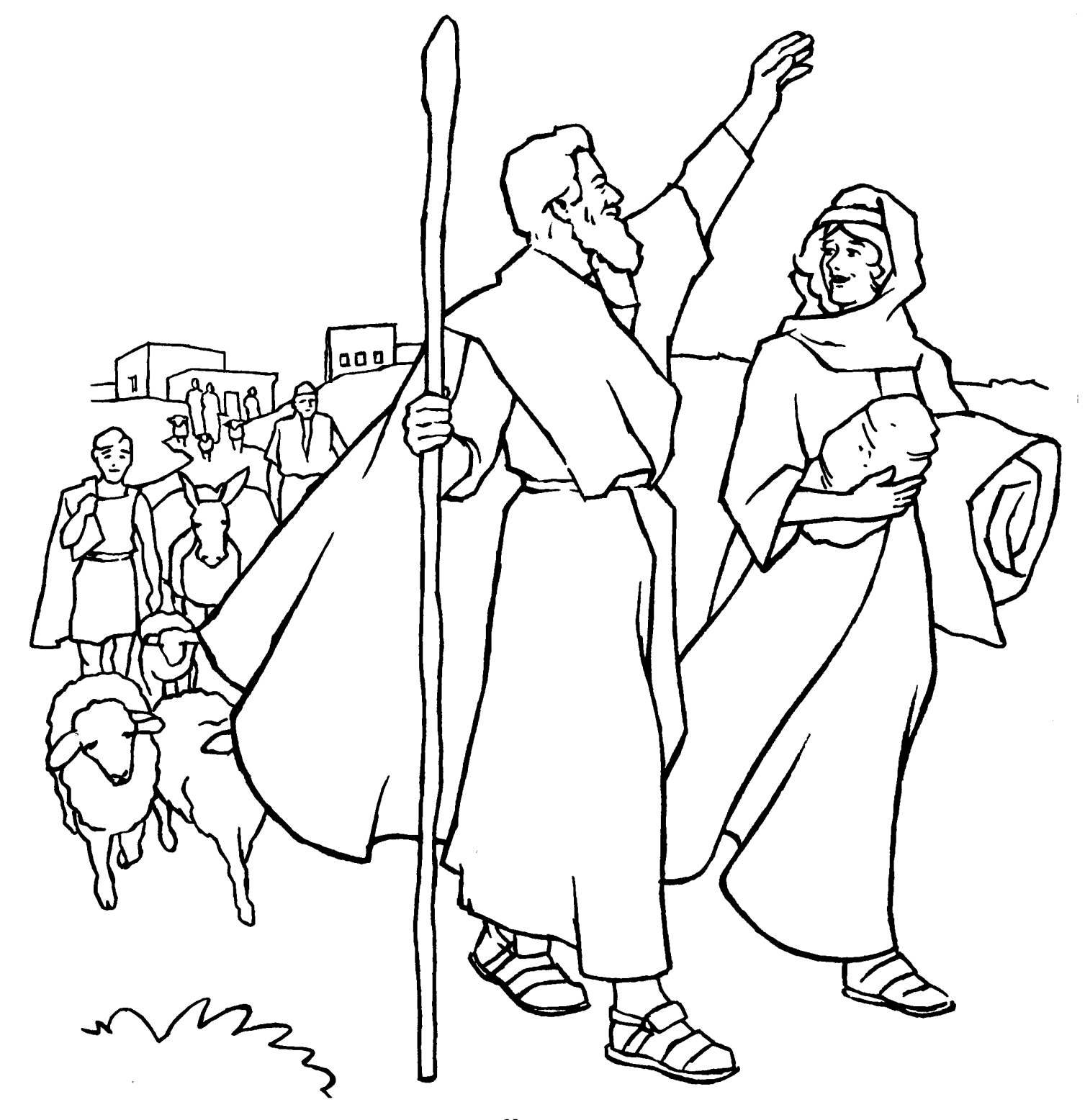
The Israelites were very happy that God delivered them from slavery in Egypt.

Parents: Ask your child this question: Why were the Israelites happy when they left Egypt? Explain to your child what their departure from Egypt represents for God's people today.