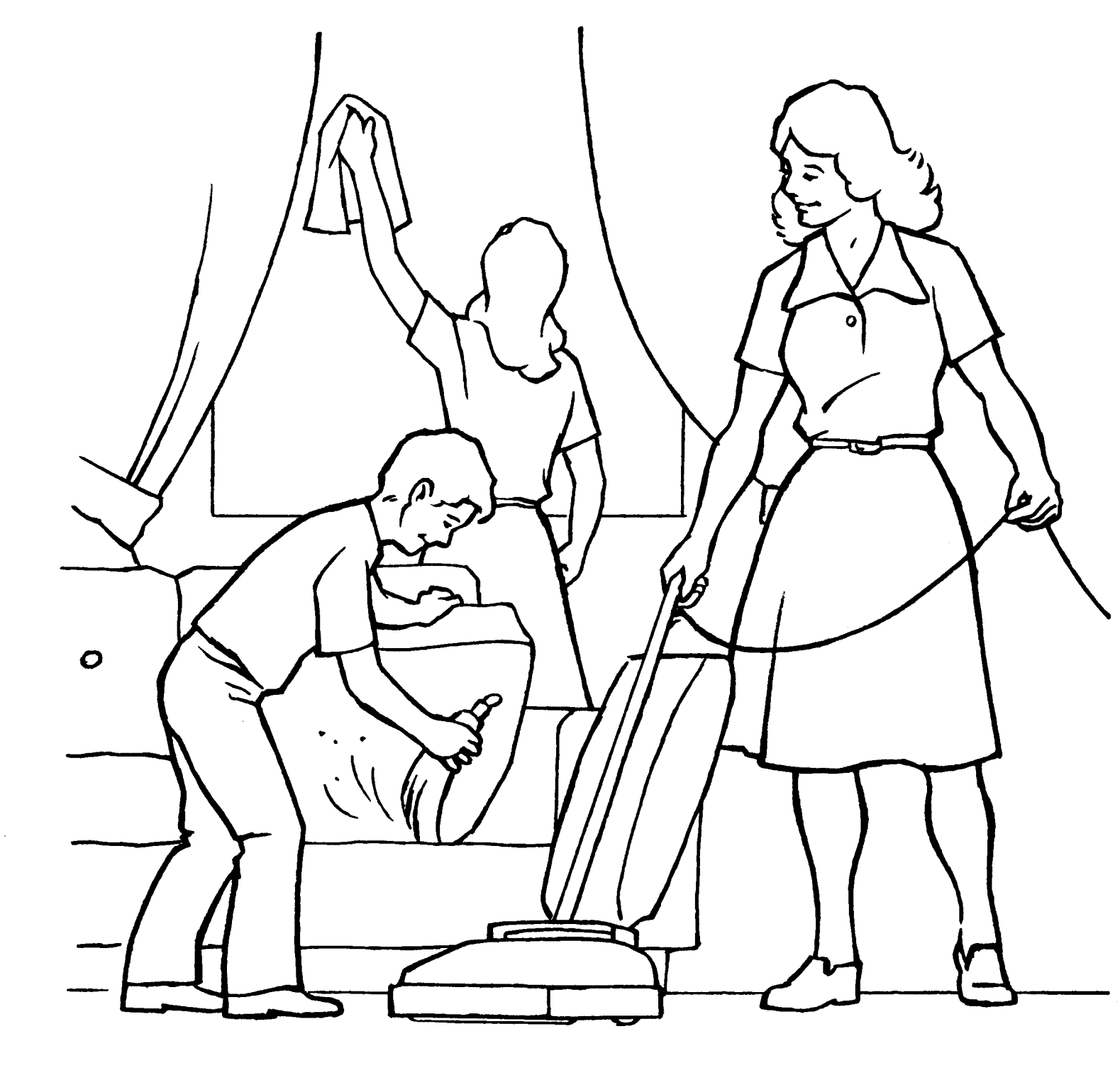
Just before the Days of Unleavened Bread, we must put all the leavening out of our homes.

Parents: Ask your child what leavening has to do with bread. Then explain the relationship between leavening and sin, and why it is so important not to sin.