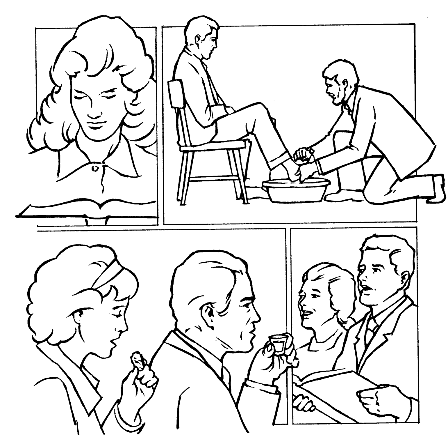
Today, these are the things God's people do on Passover night to remember Christ's death.

Parents: Instruct your child to color the pictures. Also, review the meaning of Passover, and the meaning of each of the pictures.